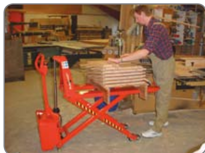
Optional extras: remote control, level control, brake, separate or built-in charger.