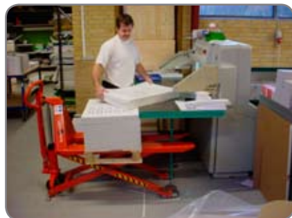
Very low power for the pump function, foot protection and neutral position are important features of HL 1005.