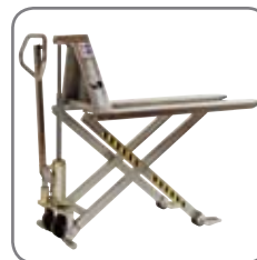
Available as manual, electric, stainless and explosion proof.