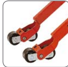
The tandem wheels have a brake effect and are not hostile to the floor.