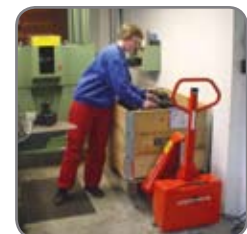
Patented cylinder construction gives low overall height.