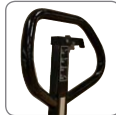
Ergonomic handle ensures the user a relaxed hold.