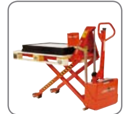
Level control (optional extra) ensures a constant working height.