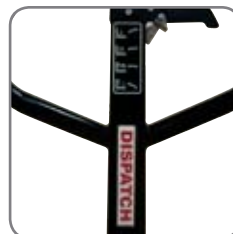
Can be marked with name/department.